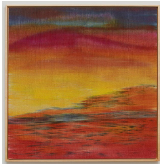
Hildur Ásgeirsdóttir Jónsson

the images, reworking them until she has the desired composition. She begins each work by painting the images on the loose silk threads – next these hand painted warp threads are transferred to the loom. The weaving then commences and the image is combined with the woven weft horizontal threads. Jónsson’s practice is squarely at the intersection of weaving and painting, where she deconstructs elements of both processes. The hybridized results blur the boundaries and sit comfortably between fine art and craft.