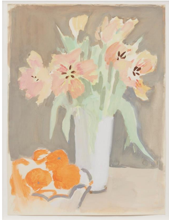
Joe Brainard Tulips and Oranges , c. 1967-68 gouache on paper

Tibor de Nagy is pleased to present Joe Brainard - a box of hearts and other works , an exhibition of over 50 works, many never or rarely exhibited before. Among those are Tulips and Oranges (pictured above), a newly discovered large Nancy collage made for the Art News Annual cover in 1968, and the early Pop painting 7-Up . Two miniature works, A Box of Hearts and Little Letters , will be also on view for the first time.