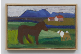
LOUISA MATTHÍASDÓTTIR Landscape with Horse and Dog , ca. 1986 oil on canvas 10 x 16 inches (25.4 x 41.3 cm) (Inv. No. LM9583)

Louisa Matthíasdóttir Hestar - Paintings in Iceland January 29 to March 10, 2022