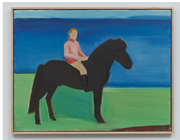
LOUISA MATTHÍASDÓTTIR Black Horse with Pink Shirted Rider , ca. 1986 oil on canvas 19 x 25 inches (48.3 x 63.5 cm) (Inv. No. LM9594)