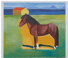
LOUISA MATTHÍASDÓTTIR Dark Horse, Yellow House, Red Roof I , ca. 1987-80 oil on canvas 62 x 70 inches (167.6 x 167.6 cm) (Inv. No. LM9597)