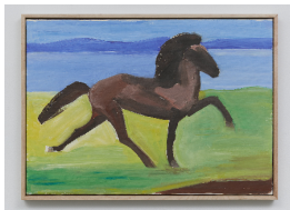
LOUISA MATTHÍASDÓTTIR Horse, Galloping , ca. 1986 oil on canvas 15 x 21 inches (38.1 x 53.3 cm) (Inv. No. LM9590)