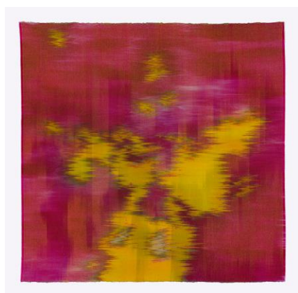
Lichen 2 , 2016, silk and dyes, 27 ½ x 28 inches

Hildur Ásgeirsdóttir Jónsson creates woven color field-like paintings. Jónsson weaves hand-dyed, hand-loomed silk textiles, both small and very large in scale. In her first exhibition with the gallery, the show will include a group of small new works as well as one large piece.