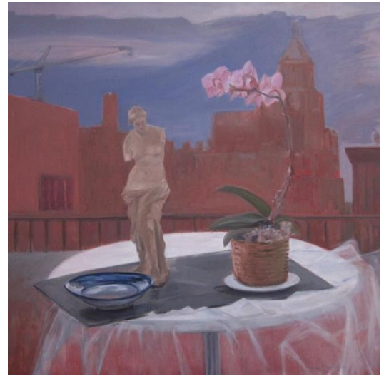
Still Life on a Balcony , 1987, oil on linen 36 x 36 inches