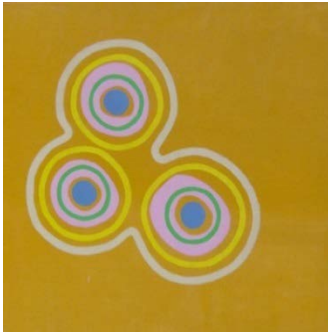
Edward Avedisian, Normal Love #1 , 1963 Liquitex on canvas, 67 ¼ x 67 ½ inches