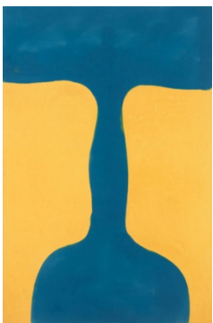
Paul Feeley, Trajan , 1960 oil-based enamel on canvas, 69 x 46 inches

The gallery is pleased to present an exhibition that will comprise nine large-scale paintings and a selection of smaller works on paper by nine abstract painters. Each of the artists in the show exhibited with the gallery.