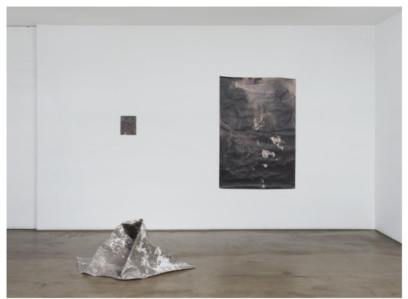
Joy Episalla, installation view