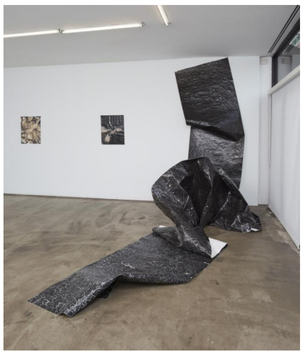
Joy Episalla, installation view