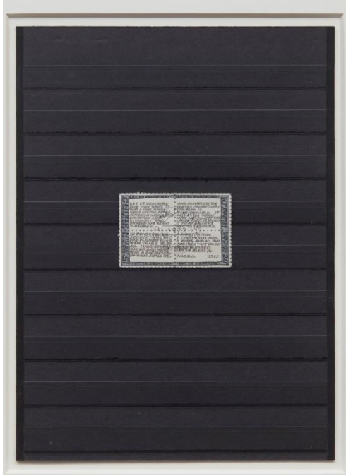
Donald Evans, "Stein, 1972. Fiftieth anniversary of 'A Valentine to Sherwood Anderson' by Gertrude Stein" (1972), watercolor and rubber stamp on paper

Donald Evans: Philatelic Counter continues at Tibor de Nagy gallery (11 Rivington Street, Lower East Side, Manhattan) through June 4. The exhibition was organized by the gallery.