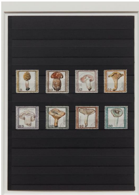
Donald Evans, "Sabot, 1966. Edible mushrooms" (1973), watercolor and rubber stamp on paper

In "Domino, 1938, Dominoes" (1975), Evans's meticulous devotion to making what appears to be a sheet of 36 stamps picturing a domino is astonishing for its accuracy, tenderness, and vulnerability. Even the white border around the stamps is carefully attended to, with the title and date of issue "printed" on the bottom right edge. It is the kind of perfection we have come to expect from an artist such as Vija Celmins. The difference between Celmins and Evans is in the scale. However, it is wrong to say that Evans is a miniaturist because he is working in a 1:1 relationship.