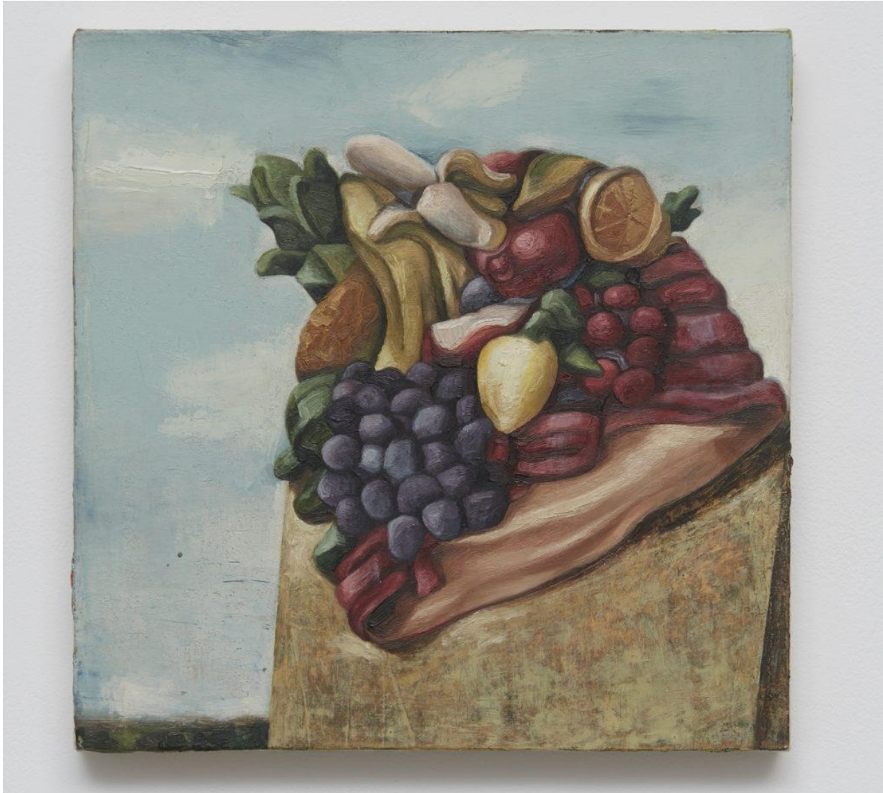
Richard Baker, Rubber Fruit Hat Bounty – Bounty, 1993, oil on linen, 14 x 14 inches

What a pleasure it was to see some of these paintings again. After all these years, I'm still smitten with the rough surfaces and the gloomy color that perfectly evokes the New England shoreline in winter. In Palette , Baker creates a scene in which we are gazing into the distance while also looking down at the palette. Propped up, the palette depicted suggests that a white mound of pigment could be a tree in the foreground—a wry joke about how painters see the landscape and then translate it into paint. A tiny painting called Toss captures the joy of a painter with time in the studio. A seaweed pod floats in the air, larger than the barren tree, the sand dune fencing, and the tiny smokestack in the distance. If Baker is intent on charming fellow painters, he certainly succeeds, especially in Untitled (Pot of Brushes) where he swaps a traditional still-life bouquet for a teapot full of used brushes that, to my eye, are more beautiful than the brightest dahlias. Flowers aren't strictly necessary when you have the time and the tools to paint everything you want.