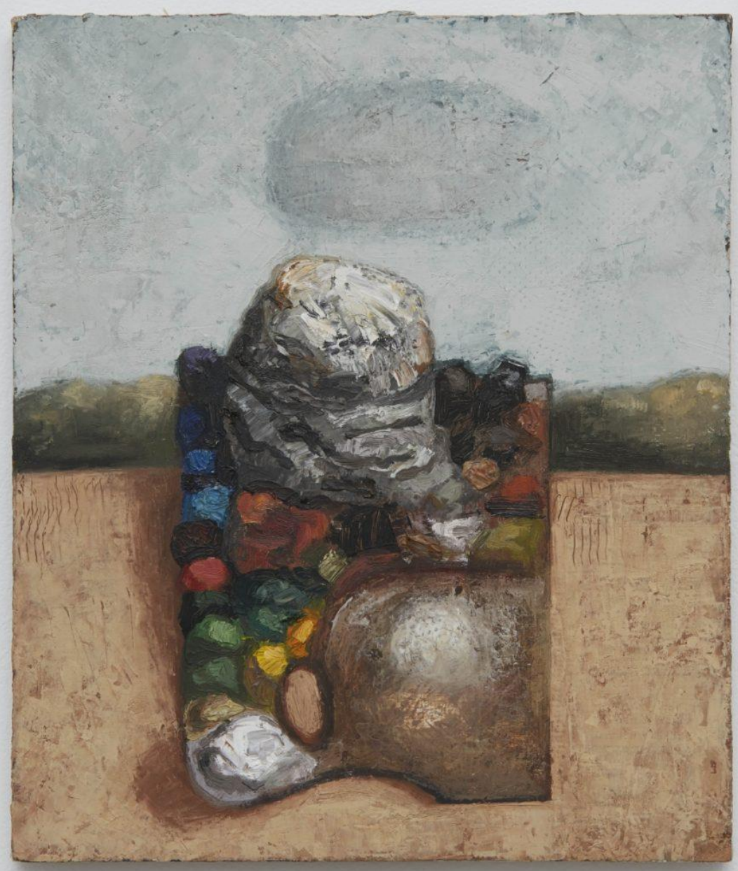
Richard Baker, Palette , 1990, oil on linen, 13 x 11 inches