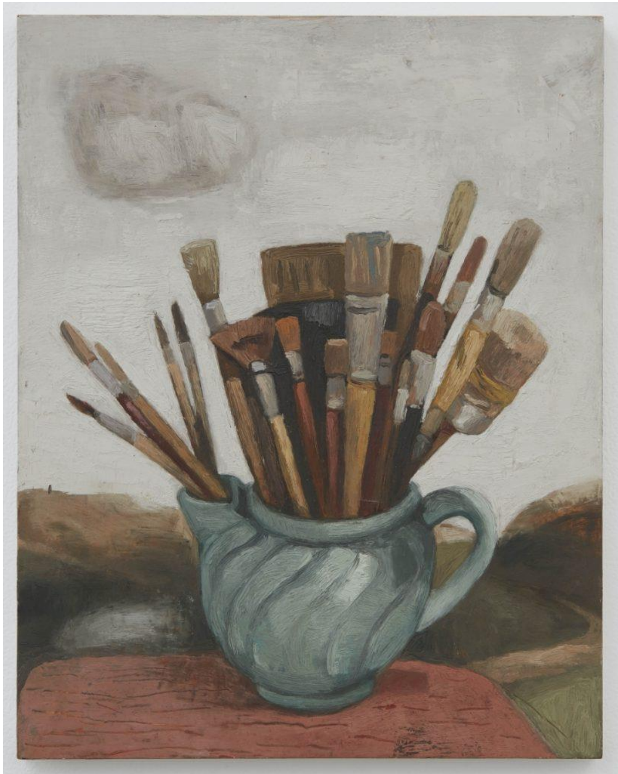
Richard Baker, Untitled (Pot of Brushes), 1989, oil on panel, 14 x 11 inches