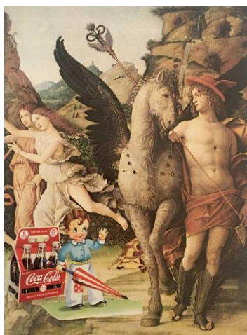
The Pause that Refreshes , 2016, collage on paper, 11 x 8 1/4 inches