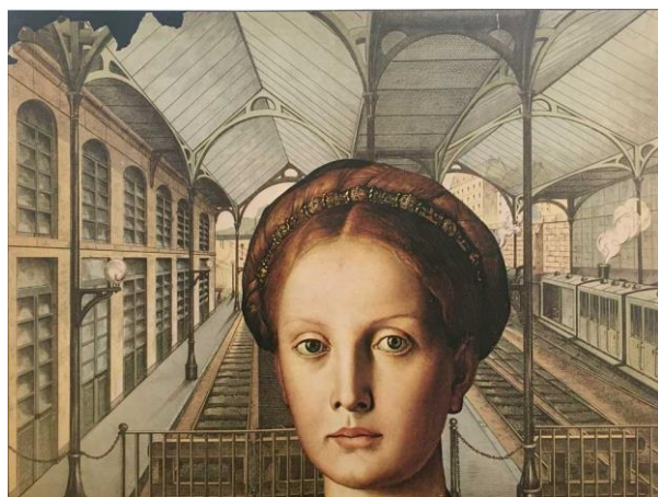
Salle d'Attente , 2016, collage on paper, 14 1/2 x 18 3/4 inches