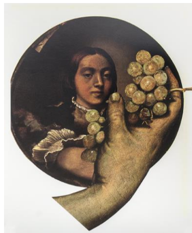
Still Life , 2016, mixed media collage, 11 x 8 1/2 inches