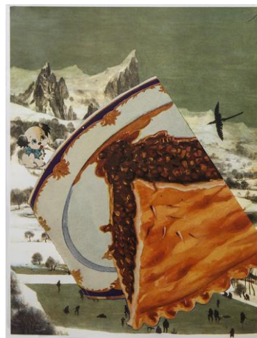
Pie in the Sky , 2016, mixed media collage, 11 x 8 3/4 inches