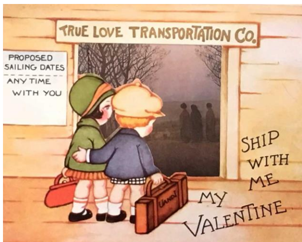
Departure Mode , 2016, collage on paper, 4 3/4 x 6 inches