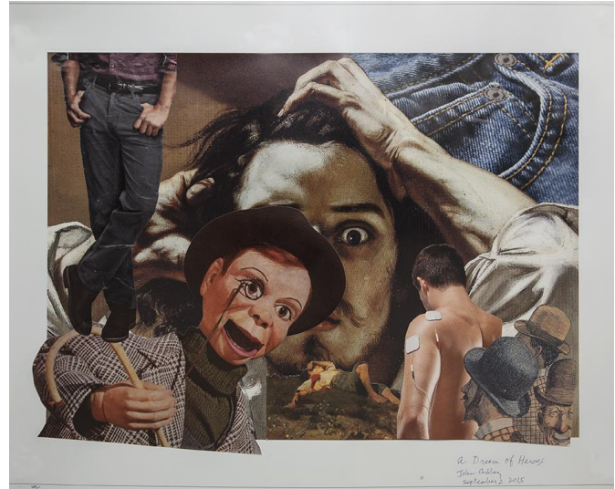
A DREAM OF HEROES, 2015, MIXED MEDIA COLLAGE, 15 3/4" X 20 1/2"

What have you done in the last two months?