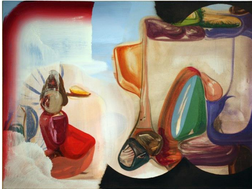
Elliott Green, "Light Buried Underground" (2008), oil on linen, 12 x 18 inches

It must be summer. There are group shows galore all over Manhattan. This is when you get to discover new artists, get enthusiastic, become disenchanted, fall in love, fall out of love, all of the above, and none of the above, in one day, and still have time to sit back and read a book of poems in the evening. I went to a gaggle of group shows the other afternoon, including Blackness in Abstraction at Pace (June 24 – August 19, 2016), The Female Gaze, Part Two: Woman Look at Men at Cheim and Read (June 23 – September 2, 2016), and Objecty at Tibor de Nagy (June 22 – July 29, 2016).