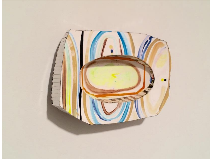
Tamara Zahaykevich, "Ovals Lay Eggs" (2016), mixed media construction, 13 ½ x 10 x 5 inches

Whereas Newman uses all kind of materials and techniques, Tamara Zahaykevich works solely with foam board, paper, and acrylic paint. "Ovals lay eggs" (2016) is a wall relief that provides an oval niche where an unnamed bird might wish to deposit its egg for safekeeping. It could also be an architectural element, a container for an oval mirror, which has been removed, or a frame for a tondo that has not yet been installed. One could say that Zahaykevich has taken a form we associate with Lee Bontecou – a wall relief whose interiors were lined with black velvet – and made it her own, no small accomplishment. The freestanding "Oblique Freak" (2016) is made from joined strips of foam board that rise, tilt, and change, like something trying to become completely erect and unable to do so.