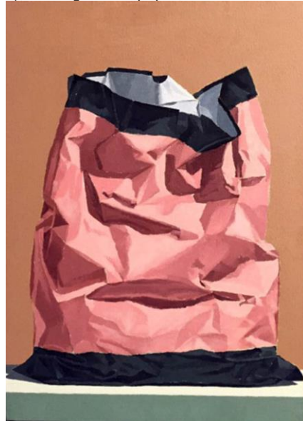
Scott Brodie, "Pink Bag with Black Border" (1999), oil on canvas, 16 x 22 inches

When Walp chooses and arranges a knife, newsprint photocopy, bar of soap or cork, I imagine her thinking isn't much different from Scott Schnepf, another painter of household still life objects. Schnepf appears to pluck and place things he's found squirreled away among kitchen cabinets and countertops. As if in homage to Jean-Baptiste-Siméon Chardin, both artists imbue these quotidian