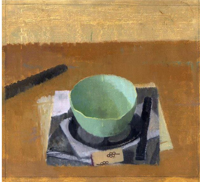
Susan Jane Walp, "Tea Bowl, Photocopy, Cork, and Knife" (2015), oil on gessoed paper, 9 1/8 x 10 1/8 inches

of a few tabletop objects. Without the torpid haze of Morandi, Walp's objects are more crystalline and sharp even with chalky pallors, a bit like snapshots lifted from a Pompeian fresco.