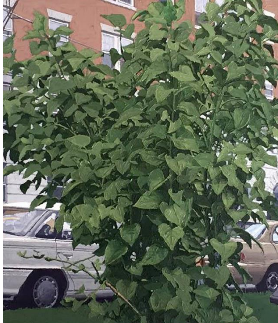
Scott Brodie, "Syringa Vulgaris at 74 Willet St." (2003), oil on canvas, 44 x 38 inches

What holds all of his work together is a muscular painterly touch and a depth and breadth knowledge of Modernism. Brodie is able to harness all sorts of painterly conventions at will, easily crossing the line between figuration or abstraction depending on the shape, scale and emotional tenor of a given project. The show is a veritable celebration of painterly painting culled from the rounds of day-to-day activities. Paintings of bright, mall-like shopping bags riff on hard-edged abstraction and the canvas support itself. Pictures of food served as entrees and side dishes are presented through the many patterned veneers of pop culture or like selfies and thought bubbles floating in the ether of social media. Aluminum foil and packets of artificial sweetener appear larger than life like sensual Op Art modules.