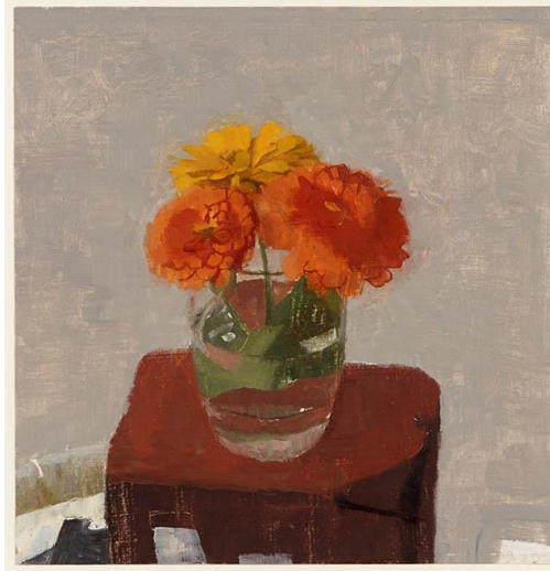
Susan Jane Walp, "Three Zinnias in a Glass of Water" (2012), oil on gessoed paper, 9 3/4 x 9 3/8 inches (courtesy Tibor de Nagy Gallery)

Walp's paintings are small and meditative, keyed around a few muted colors, a green grey, ochre, dusky blue, occasionally with a pop of bright orange when the subject is a zinnia or tangerine. The presentation is as important as the distinct objects; where objects land on the table and how they mark space, or their material being — if they are heavy or paper thin, transparent, draped, pleated. Most of the compositions are frontal but with a few she hovers overhead, all are grounded at the 90 degree angle where tabletop meets wall. Walp will flatten out a flower but with a few deft touches divulge the staggered petals circling around the stem in space. She'll abstract a vase into blocks of colored bits that represent a waterline, highlights on refracted glass, or the thin gold line around a rim.