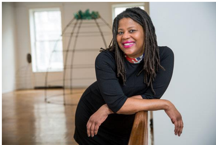
Simone Leigh's ceramic and multimedia sculptures are on view at Tilton Gallery.

That's still the program. "I'm trying to continue exploring a little bit," she said. "I think I'm still relating to the outside world and what I look at and what I hope that other people will look at as well."