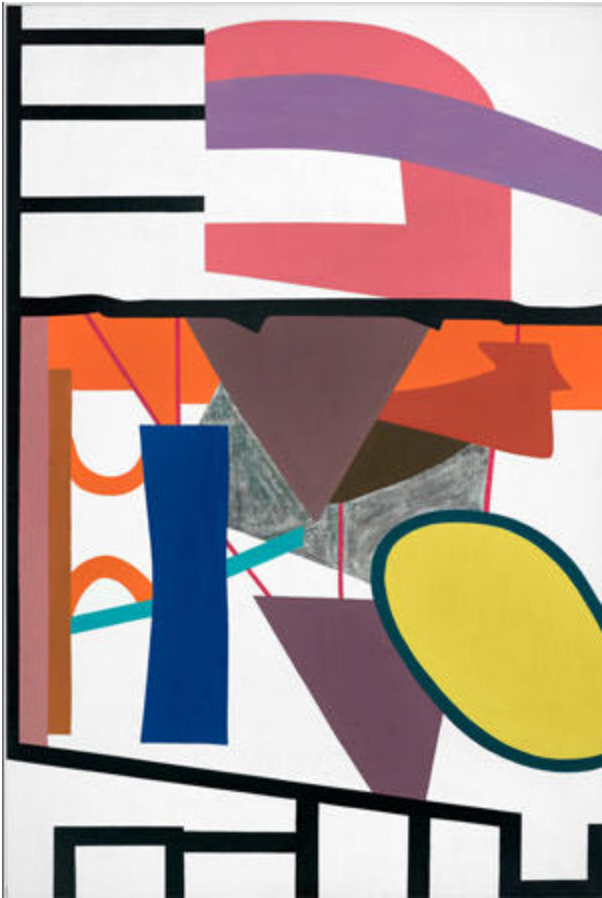
Shirley Jaffe, "New York Collage 1" (2009). Oil on canvas, 57 1/2 x 45 inches. Courtesy of the artist and Tibor de Nagy Gallery.

Jaffe: I think it just happened. But it makes me think of some other paintings that aren't here, and I'd like to go look at their reproductions to see if they did that too, because that painting was part of a group that I showed at Fournier. I don't remember which paintings were together, but I think that there probably were other paintings that had the same sensibility.