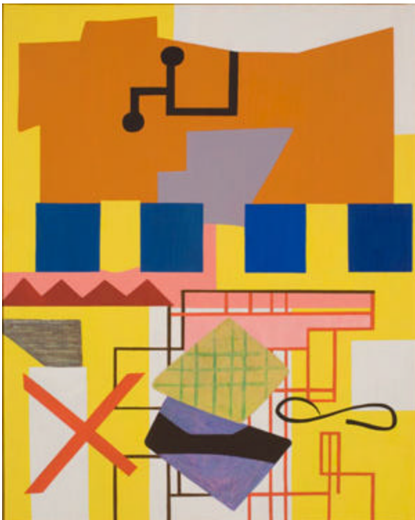
Shirley Jaffe, "Labyrinth" (2009-10). Oil on canvas, 32×25 1/2 inches.

Jaffe: It first happened as an accident, a way of introducing another surface without meticulously painting another kind of surface. It's practically mechanical, but it was interesting to me because it broke up that sameness that was developing in my paintings. And I liked the fact that I could introduce something else as a material surface.