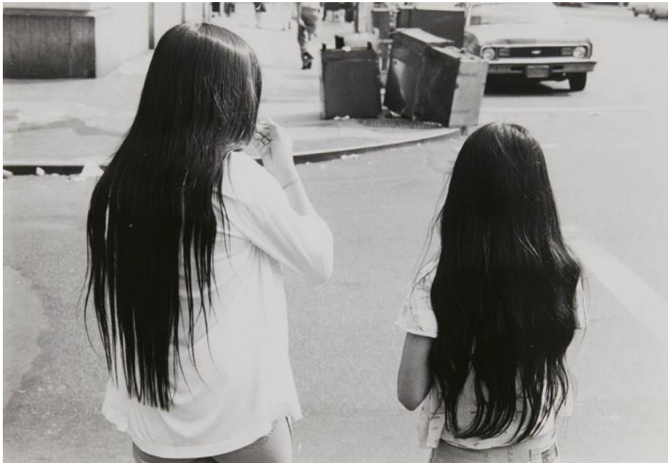
Rudy Burckhardt, “Untitled, New York, (two girls with long dark hair)” (c. 1978), gelatin-silver print, 6 3/4 x 9 3/8 inches

The themes of isolation and estrangement are absent from Burckhardt’s photographs. He was drawn to scenes such as a mother holding her child as they cross a street or a young couple on their way somewhere. They are dressed casually. His subjects are often people of color, who express trust in this older white man taking their photograph.