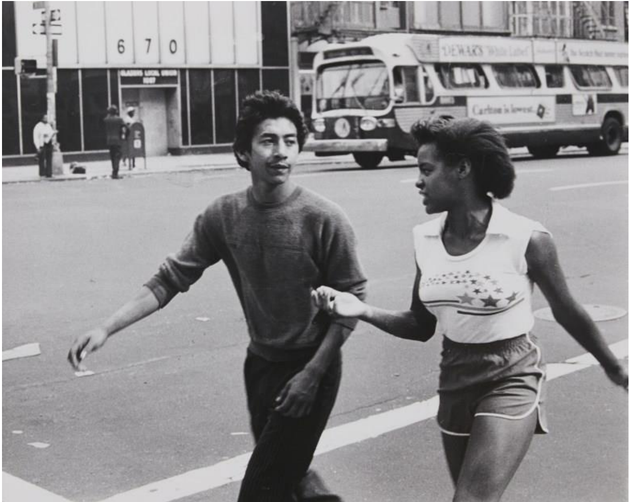
Rudy Burckhardt, "Walking Couple" (c. 1978), gelatin-silver print, 9 1/2 x 11 1/2 inches

I am not disputing the greatness of Evans's photographs, which are riveting. Rather, I am suggesting that we might need to rethink our terms. In the Subway Portraits , Evans defines the observer as a voyeur; we get to look without worrying what the subject of our attention might think. It is a kind of looking that is considered intrusive and even judgmental; you are looking and being looked at for a reason.