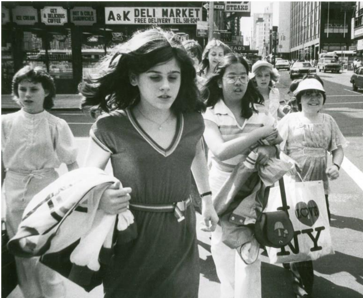
Rudy Burckhardt, “34th Street, New York” (1978), gelatin-silver print, 10 1/4 x 12 3/4 inches

Burckhardt was never surreptitious when he was working; he did not hide his camera, and his subjects often knew they were being photographed. In one image, “New York Subway (seated man with crossed arms)” (gelatin-silver print, 9 3/8 x 7 inches, ca. 1985), a man in a suit and tie seated opposite Burckhardt stares disapprovingly, his arms folded across his chest. To his right, a standing young woman is leaning against the partition separating the seats from the subway door, looking in the opposite direction. Their negative and aloof reactions are the exception, rather than the rule — and that is unexpected.