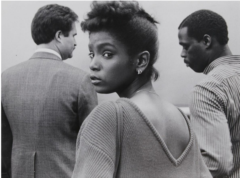
Rudy Burckhardt, "V-Back, New York" (1985), gelatin-silver print, 8 x 10 inches (all images courtesy Tibor de Nagy Gallery)

In a world where an artist is either a professional or an outsider, it is useful to consider these words by Rudy Burckhardt: