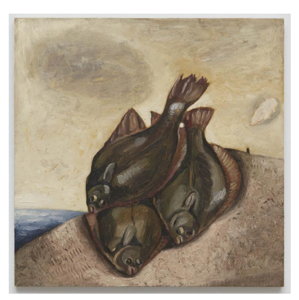
Richard Baker, "Flatfish" (1990), oil on panel, 16 x 16 inches

Ironically, now I'm back in New England where those paintings were first made. Cape Cod has a greater connection to the natural environment, and when I lived in New York, I was painting things like toys and manufactured items. So it's interesting to go back to flowers, fish, stones, shells, and see how New York may have changed me.