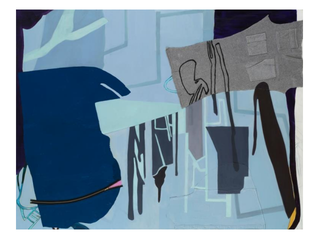
Big Blue, 2016, oil and collaged materials on canvas, 84 x 64 inches

This new body of work, inventive and considered, is a departure for MacPhee. Last year during a visit to her Ridgewood studio, I saw some older paintings and works on paper. The images had a dystopic vibe, depicting fragments of architecture and deflated, almost comical, non-referential blob-like shapes. At the time, the painting titled Big Blue was still a work in progress, and MacPhee had pasted some old sweat pants and a zipper onto the painted image. She had them lying around from a previous, unrelated project: upcycling cheap clothes into jumpsuits to give as amusing gifts for friends. The addition of the clothing parts was an interesting new development on the canvas, but MacPhee was still unsure whether it worked. Now, a year later, she has made up her mind: the new paintings are chock full of thick, solid-colored fabric pieces, fabric trim, and other unhinged clothing parts. They work.