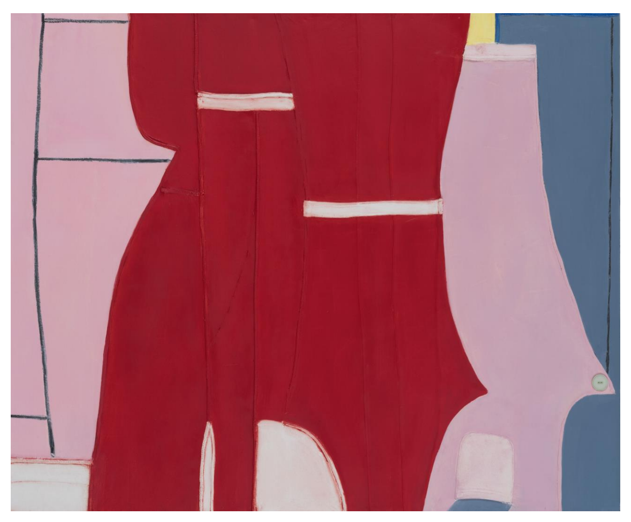
In the Red, 2017, oil and clothing on canvas, 45 x 55 inches

Contributed by Sharon Butler / Medrie MacPhee's new paintings, on view at Tibor de Nagy (recently relocated to shared space with Betty Cuningham on the Lower East Side) feature sewing notions and fabric pieces—zippers, pockets, buttons, facings, sleeves, and so forth—all harvested from cheap, disassembled clothing. The elements and shapes are flattened out, pasted onto the two-dimensional surface, and painted with a odd color palette. The effect, devoid of any fashionable digital reference or nod to our collective distraction, conjures the decisive presence and independent object-hood of abstract paintings from an earlier era.