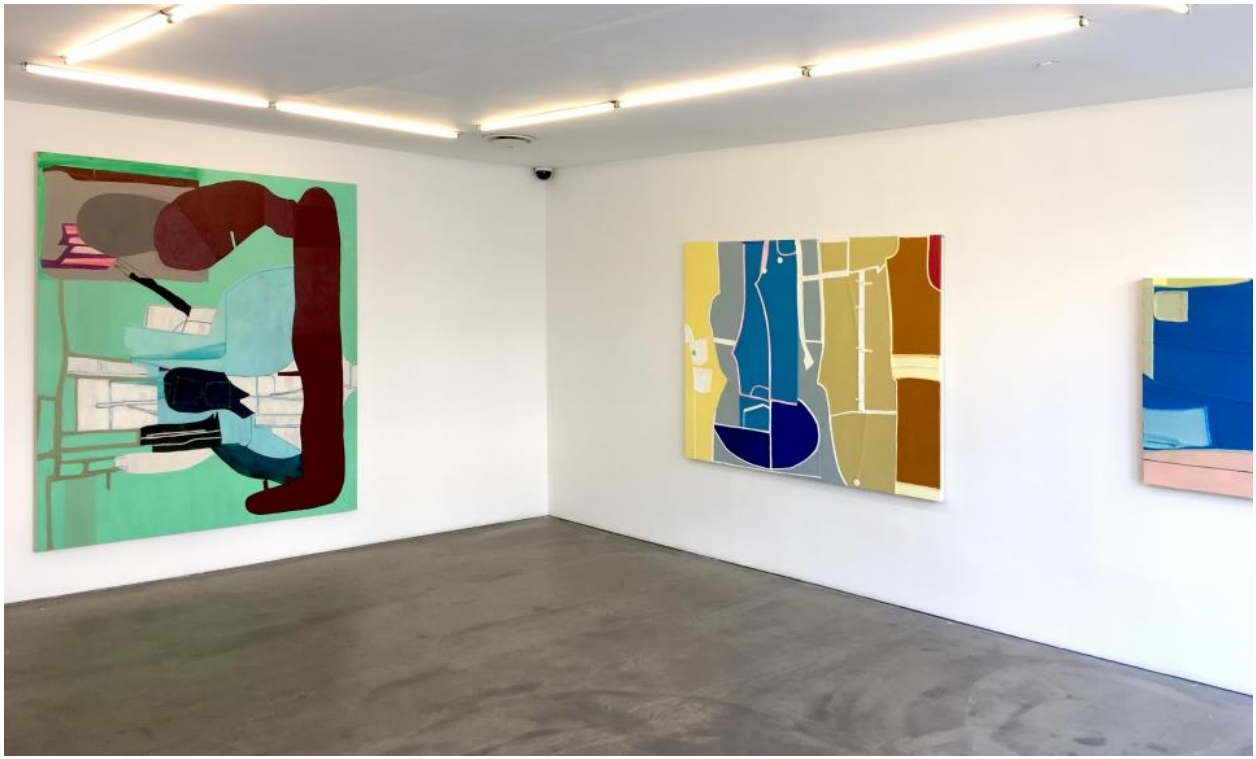
Medrie MacPhee, installation view at Tibor de Nagy

At first glance, the paintings seem like formal abstraction, investigations of relationships between shape and line, but, when seen in terms of the development of MacPhee's visual language, they are more complex than simple arrangements of form. MacPhee seems—consciously or unconsciously—to make aesthetic choices that telegraph collective despair at the instability and danger we are experiencing from our current political situation. She creates the abstract images through a process of creative destruction. Items that were once fully utilitarian and three-dimensional are dismantled, their elements recombined in new formations. The space is shallow, the lines and shapes are pushed up to the surface, and a sense of claustrophobia prevails. Expressing anxiety is, paradoxically, liberating.