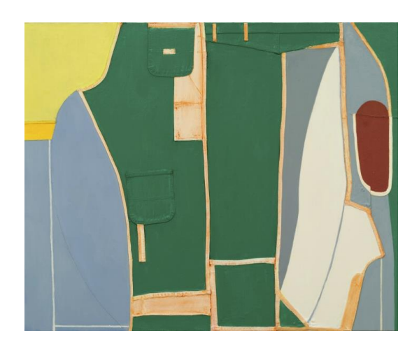
Are We Green About This?, 2017, oil and mixed media on canvas, 45 x 55 inches