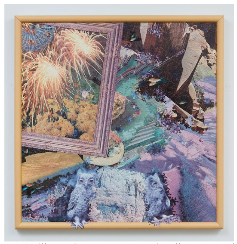
Jess (Collins), Whatever!, 1992. Puzzle collage, 38 x 37 inches.

pieces. The former is a technicolor-pastoral daydream, with searching hounds prancing through an alpine field as a boy plays checkers alone in the corner. The latter is not that : a swirling mauve gives way to desert plateaus as chromed Lynchian owls stare aside the viewer, fish swim in the air, a frame-within-a-frame bursts with wildflowers and fireworks. (It's important to note that in Jess's pre-Beat Army scientist years, he played a small role in the Manhattan Project: ergo, this was someone who uniquely understood the apocalyptic power of a colossal explosion.) Both are cinematic and overpowering, and that's before you notice their impressive physicality, whether it be the canvas-on-canvas depth of Game's Up or the reptilian silhouette-pieces that climb desperately up the face of Whatever! . You can see these from the gallery's windows facing Rivington Street, and I'd start looking from outside in before giving them a slow zoom.