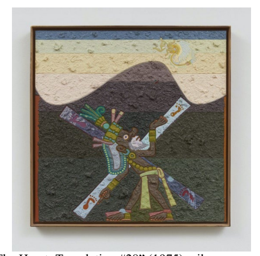
Jess, "Crossing And Recrossing The Heart: Translation #28" (1975), oil on canvasboard, 19 11/16 x 19 11/16 inches

With the puzzles, Jess assembled a fantastical world made of disparate layers. In addition to these and the paste-ups, he was also a painter, and studied with Clyfford Still and Edward Corbett at the California School of Fine Arts. These memories surfaced when I went to see the exhibition <u>Jess (Collins): Piling Up the Rectangles; Paintings, Paste-Ups and Puzzle Collages</u> at Tibor de Nagy.