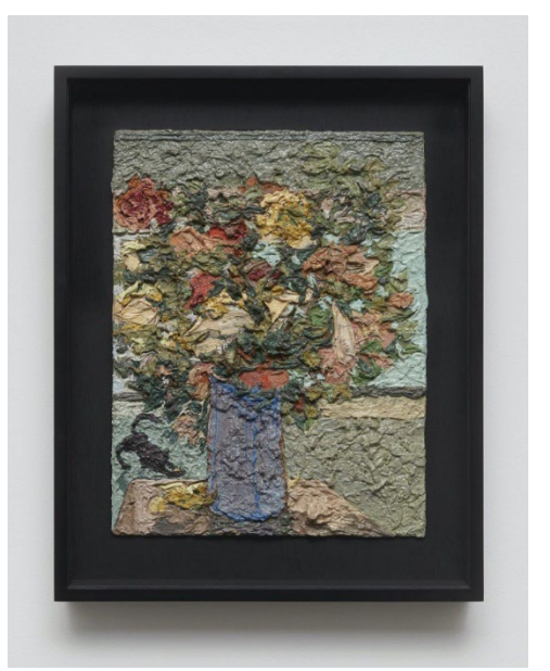
Jess, "Petals of Paint" (1964), oil on plywood, 16 x 12 inches

<u>Jess (Collins)</u>: <u>Piling Up the Rectangles</u>; <u>Paintings, Paste-Ups and Puzzle Collages</u> continues at Tibor de Nagy (11 Rivington Street, Lower East Side, Manhattan) through April 13. The exhibition was organized by the gallery.