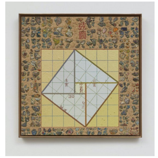
Jess, "Piling Up The Rectangles: Translation #27" (1975), oil on canvasboard, 19 11/16 x 19 11/16 inches

Jess's art is both open and impenetrable, like a temple that is full of inexplicable things and whose devotees are unknown to us.